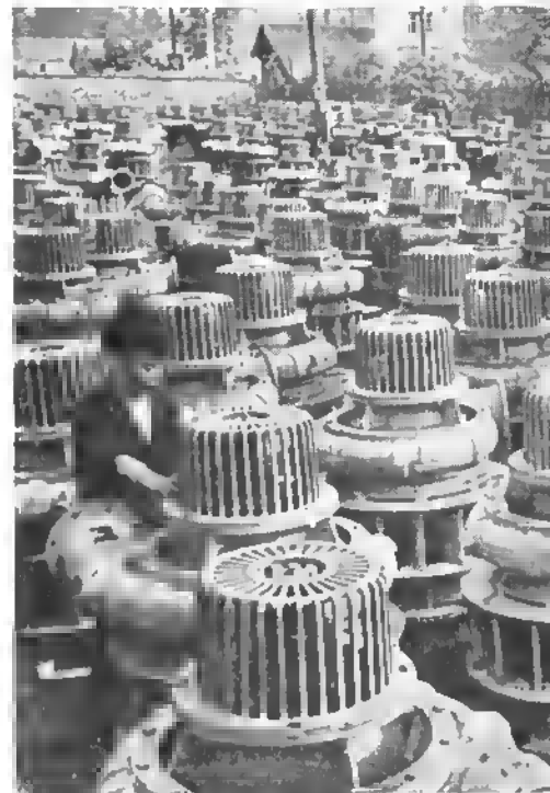
A new type water turbine—Liuchou Farm Machinery Factory of the Kwangsi Chuang Autonomous Region.

Plant in the northeast, boldly designed and made China's first 35 h.p. tractors, which the workers named the "Yaluchiang No. 1". Their revolutionary spirit of daring to think and make revolution won the praise of Chairman Mao. His citation honouring them, " The lowly are most intelligent and the elite are most ignorant ", inspired workers in the entire farm machinery industry (see China Reconstructs , April 1969).